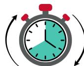
Spend Less Time on Transactional HR