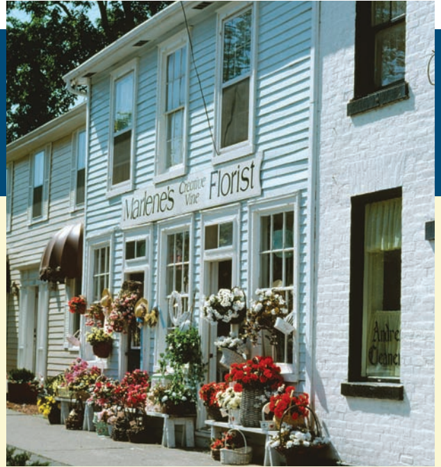
Ideal for small businesses.